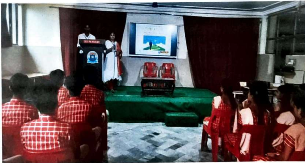
An orientation program on "Future Perfect" Dated: 5-09-2021