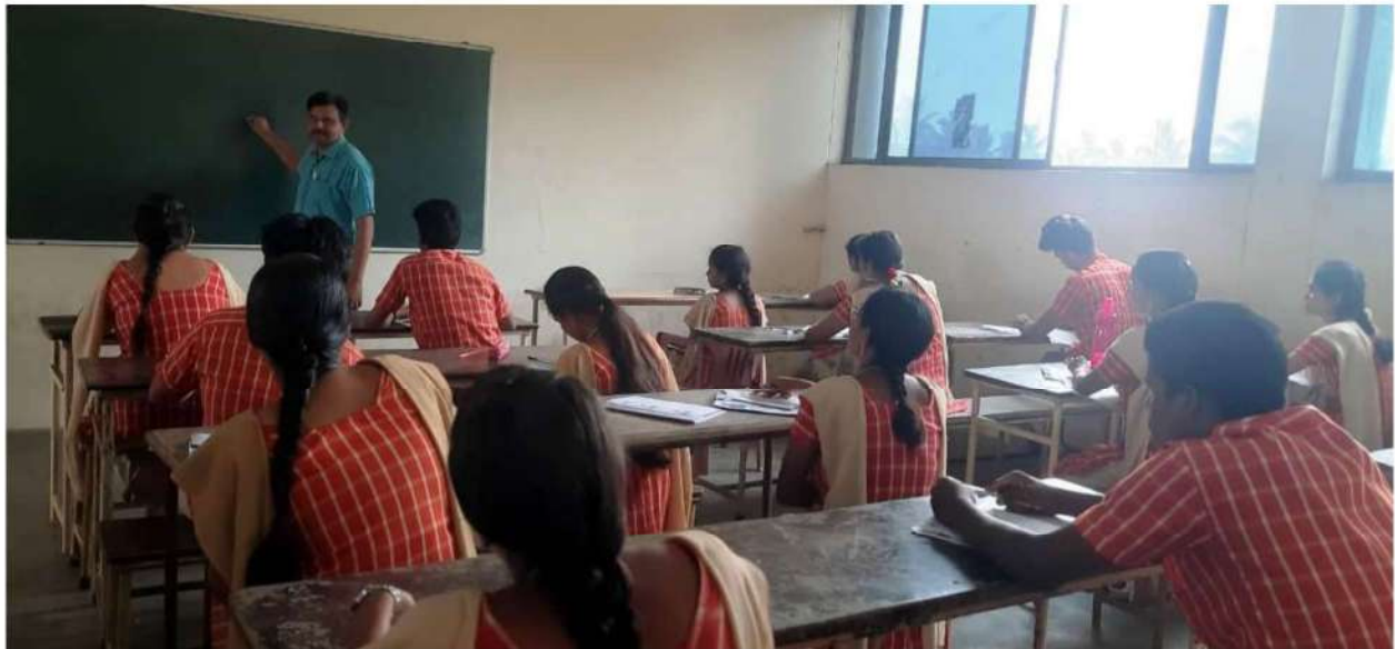
An awareness program on "CAREER GUIDANCE" conducted on 21-12-2021